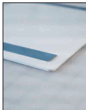
VHB Mounting Tape