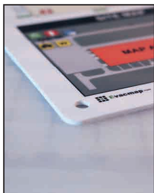
Pre-drilled mounting holes