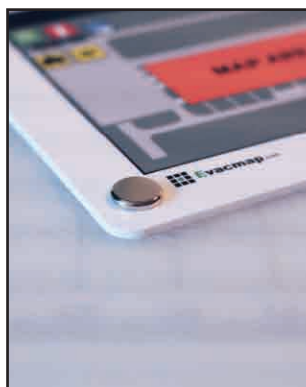
Pre-drilled mounting holes & decorative caps