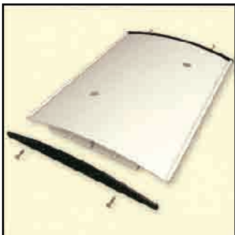
Removable end caps