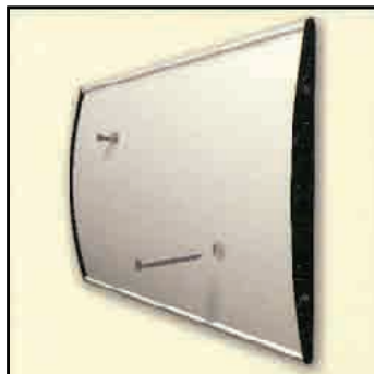
Hidden screw mounting option