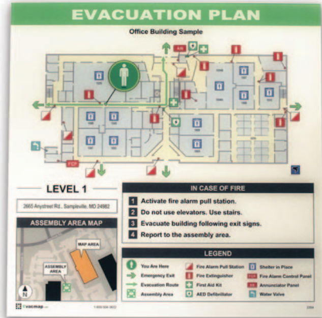
★ Our Most Durable Plaque